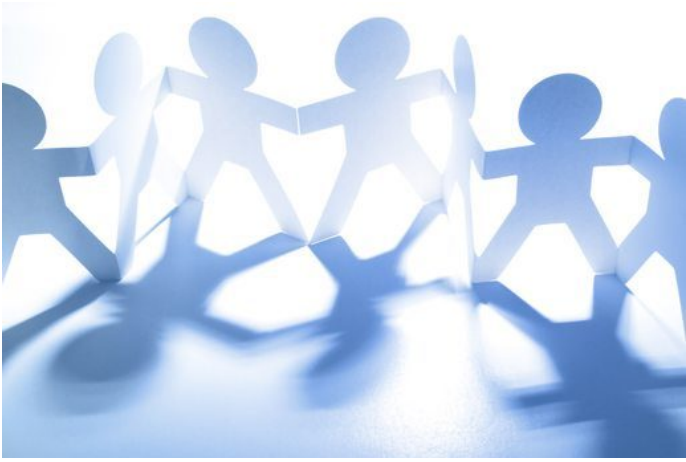
Mass Tort & Class Action