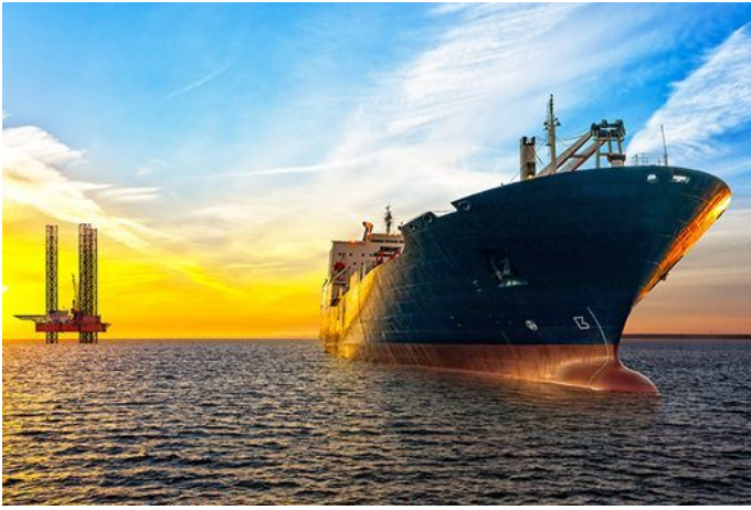
Maritime & Admiralty